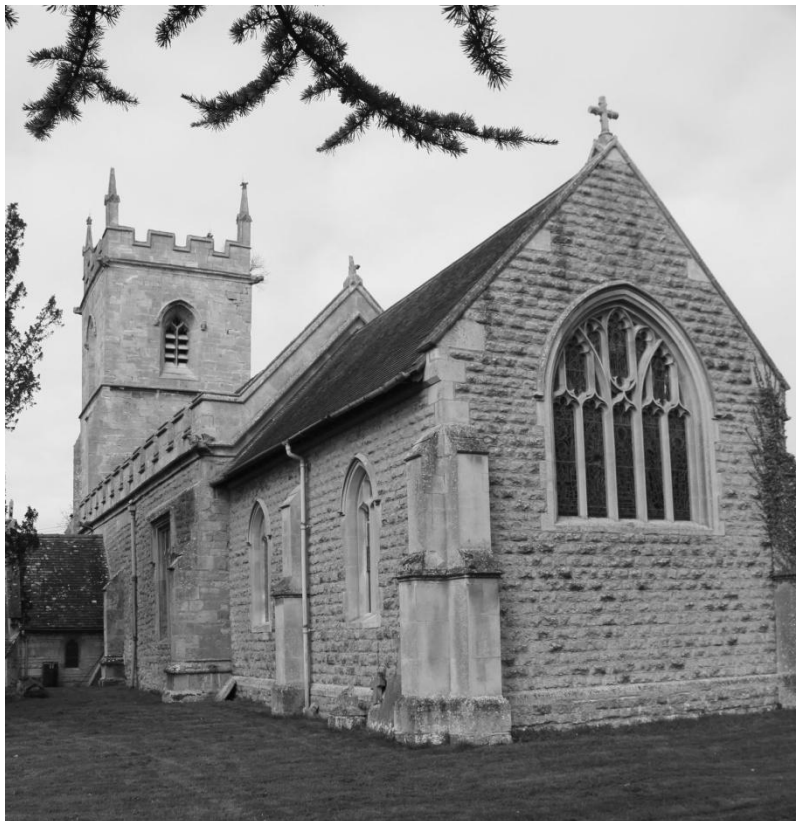
St Peter's, Hinton-on-the-Green

The magazine of the Churches of Hampton, with Sedgeberrow and Hinton-on-the-Green