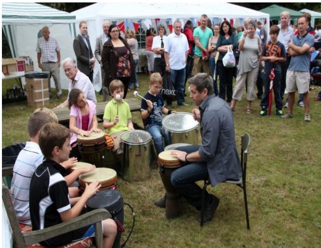
Drummers from St Andrew's School