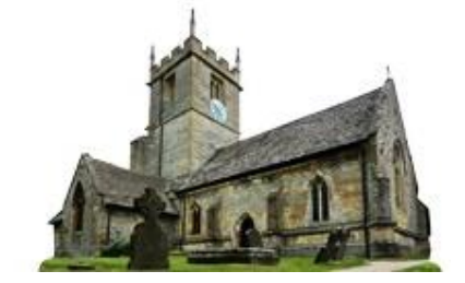
Hampton – Fairfield – Thistledown Eastwick Park – Charity Crescent