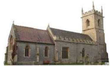
Hinton on the Green