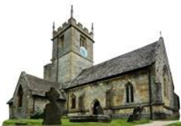
Hampton – Fairfield – Thistledown Eastwick Park – Charity Crescent