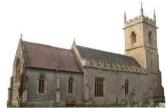
Hinton on the Green