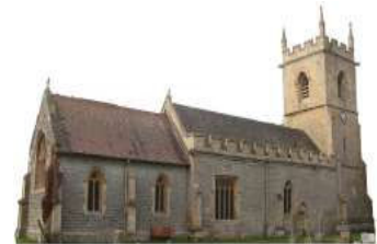
Hinton on the Green