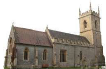
Hinton on the Green