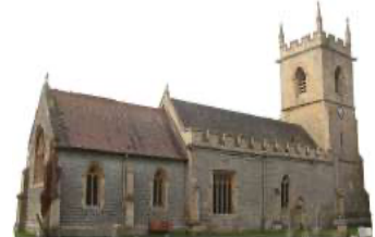
Hinton on the Green