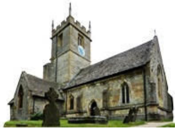
Hampton – Fairfield – Thistledown Eastwick Park – Charity Crescent