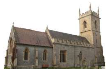
Hinton on the Green