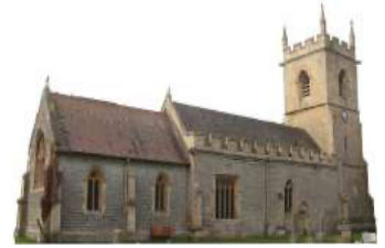
Hinton on the Green