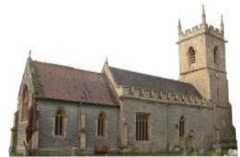
Hinton on the Green