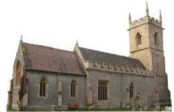
Hinton on the Green