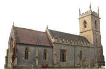
Hinton on the Green